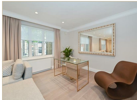
Red Lion Yard Approx. Gross Internal Area 834 Sq Ft - 77.48 Sq M